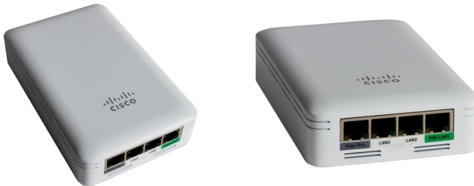
Figure 1. Cisco Aironet 1815w Access Point

Packing 802.11ac Wave 2 wireless standards support and Gigabit Ethernet wired connectivity into a sleek device, the 1815w is built to take full advantage of existing cabling infrastructure while blending into the visual footprint. This combination provides best-in-class performance while reducing total cost of ownership.